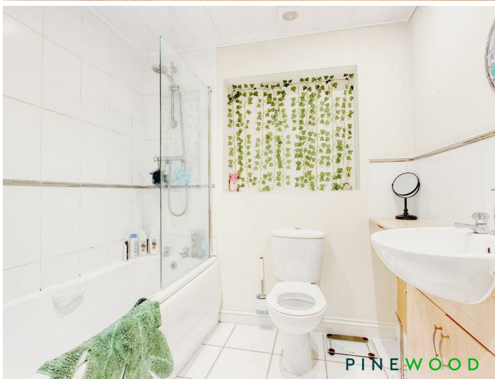
Linacre House, Archdale Close, Chesterfield, Derbyshire S40 2GE